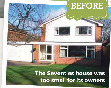
The Seventies house was too small for its owners