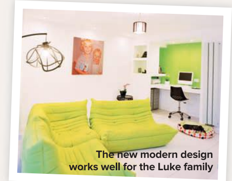
The new modern design works well for the Luke family

The whole design and build cost £360,000, and took eight months to complete. ‘Now we have a living space which works really well for us as a family and makes a far better use of the space,’ says Simon.